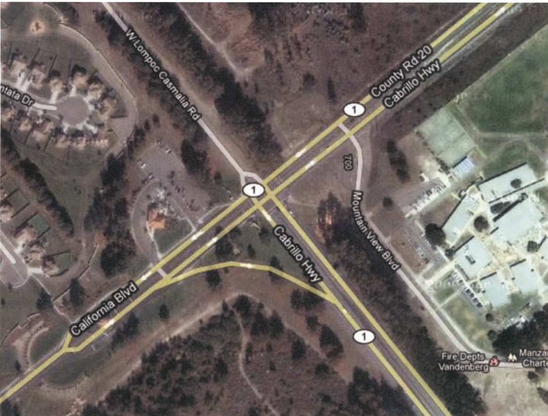
Santa Maria-Highway 1 Gate to Vandenberg Air Force Base